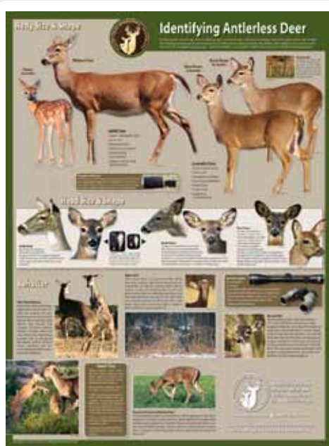
QDMA's educational poster, Identifying Antlerless Deer , can help keep your group informed when you cross the bridge into more selective doe harvest goals. Visit www.QDMA.com to order this and other posters in QDMA's educational series.

For those hunter-managers in an advanced stage of deer management, an understanding of how age and experience potentially affects fawn production leads to the correct answer for the question of "Which type of does should we harvest?" In well-managed herds, you no longer need to maximize the number of does